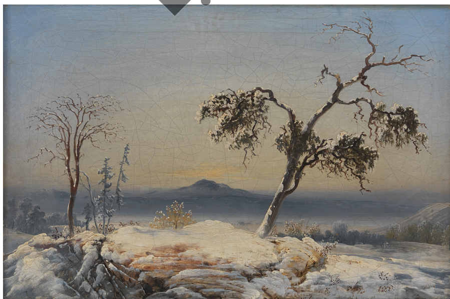
Landskap fra Finnmark